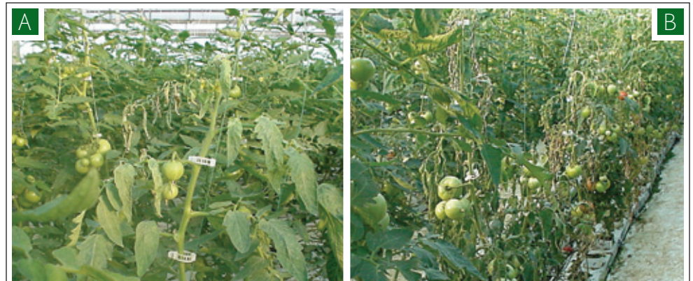
Figure 7. A) Early and B) advanced leaf scorch symptoms typical of bacterial canker in greenhouse tomatoes.

■ Pruning, harvesting and other handling operations: Greenhouses should be kept clean and thoroughly disinfected between crops. Hands and tools should be sanitized between plants or rows with a disinfectant solution to minimize pathogen spread. Clippers and knives that deliver a disinfectant to the cutting surface during each cut are commercially available, and when used with an effective disinfectant, such as Virkon or KleenGrow, can also help to prevent the spread of Cmm. Knives or clippers that do not deliver a disinfectant are not recommended for pruning, suckering or harvesting. These