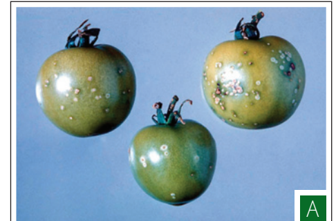
Figure 2. A) Bacterial canker on green tomato, showing the typical white to yellow halo or “bird’s-eye” symptom. B) The red tomato shows some brown spots surrounded by a white halo caused by Cmm. The darker brown spots (with no halo) are caused by a different bacterial pathogen, Pseudomonas syringae pv. tomato.

Fruit: Small dark spots on the fruit surrounded by a white halo or “bird’s-eye” spots are characteristic of bacterial canker on field-grown fruit. Spots become raised and the centers turn brown with age. Infections, and the resulting spots, occur when Cmm bacteria are deposited on fruit by splashing water from rain or overhead irrigation, or mechanically during handling of the plants. When internally infected fruit are