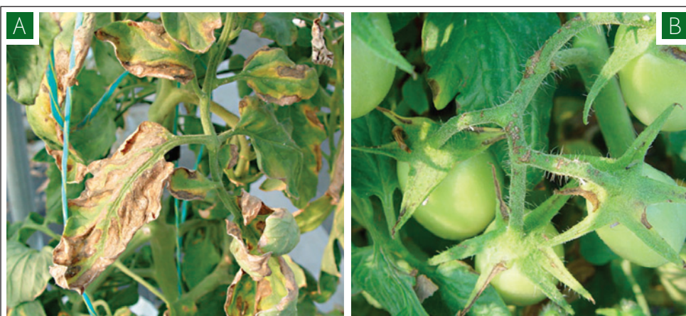
Figure 1. A) Leaf necrosis often called “firing”. B) Peduncles and calyx illustrating necrotic lesions.

opened, yellowing or browning caused by the decay of the tissues may be seen. In the greenhouse, bird’s-eye spots are typically not observed, but fruit may appear netted or marbled, or they may remain symptomless.