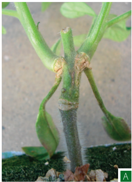
Figure 6. A and B) Typical stem lesions on young plants. Note the graft site.