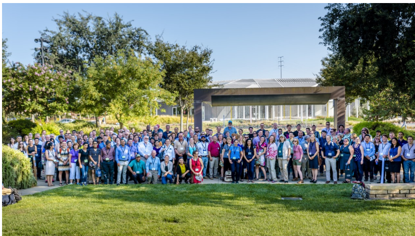
Left: NAPB Members at the 2017 Annual Meeting. Get to know your fellow members and serve the plant breeding community on a committee!